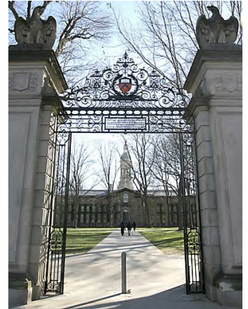
FitzRandolph Gate with Nassau Hall behind.

John Witherspoon, a Presbyterian minister from Scotland, was the college president from 1768 to 1794. He was one of the New Jersey delegates to the Second Continental Congress in Philadelphia. Witherspoon was the only clergyman and only college president to sign the American Declaration of Independence. Students during Witherspoon's presidency became 37 Judges (three of whom became justices of the U.S. Supreme Court), 49 U.S. Congressmen, 28 U.S. Senators, 10 Cabinet officers, one Vice President and one President, James Madison. The college had a big influence on the early history of our country and is one of the premier universities in our nation now. We viewed five photographs showing Princeton University including the two shown here.