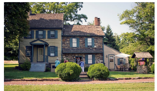
Former Andrew Mershon Tavern