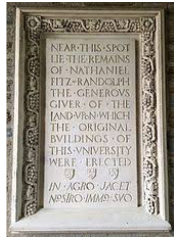
FitzRandolph Memorial Tablet at Holder Hall.