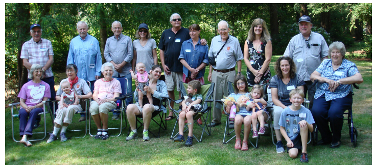
Participants at the 2018 Pacific Northwest Mershon Family Potluck Picnic at Glenn Otto Community Park, Troutdale, OR (near Portland).

August 26-30, 2019 (Monday-Friday) - Mershon Southern Chapter Informal Meeting & Vacation in Pigeon Forge, TN. See the announcement on page 4.