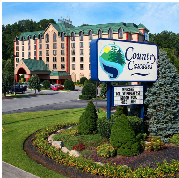
Country Cascades Hotel