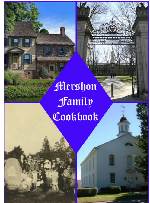
Proposed Cover for our new Mershon Family Cookbook

Saturday Evening: We will gather for a group dinner at a local restaurant.