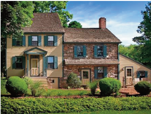
Left: The historic Andrew Mershon Tavern.