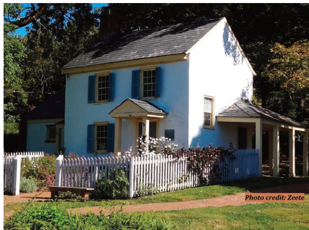
Washington Crossing State Park

Old Barracks Museum – 101 Barrack Street, Trenton, NJ 08608. The Old Barracks was built during the French & Indian War and housed Hessian soldiers before the 1776 Battle of Trenton. Open Mon. – Sat., 10 AM to 5 PM. Tours are given on the hour, with the last tour starting at 4 PM. Visit the website - http://www.barracks.org/ Admission is $8. for Adults, $6. for Seniors & Students.