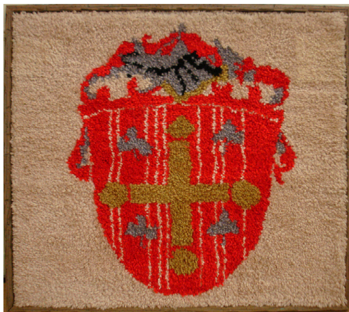
Latch-hook Mershon Family Crest