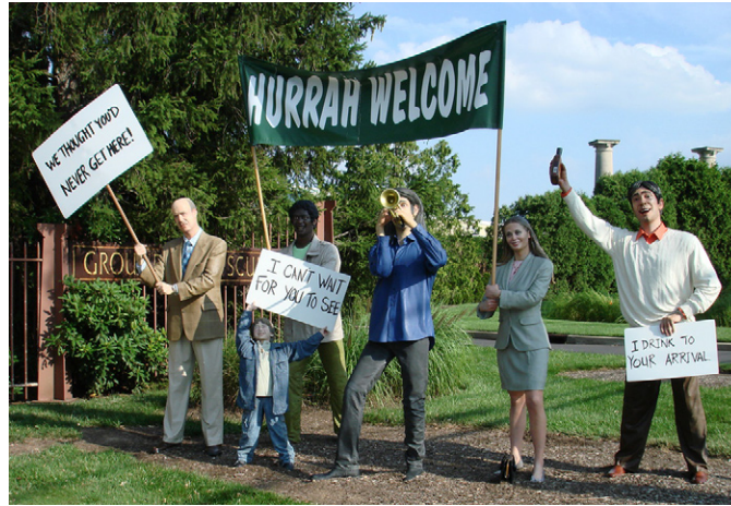
Sculpted Welcoming Committee at the Grounds for Sculpture