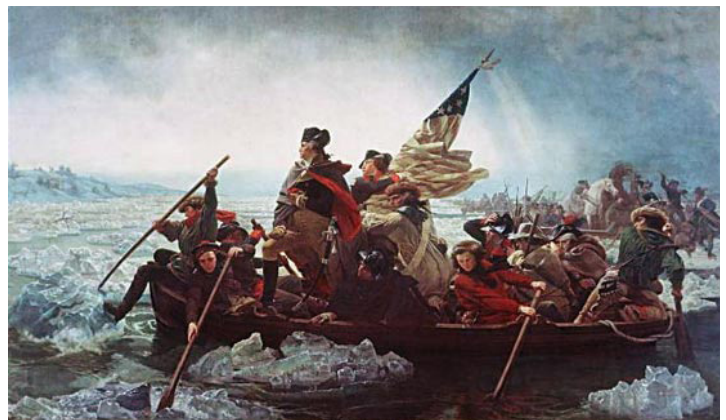
"Washington Crossing the Delaware" on the night of December 25, 1776. Painted by Emanuel Leutze in 1851. The Metropolitan Museum of Art