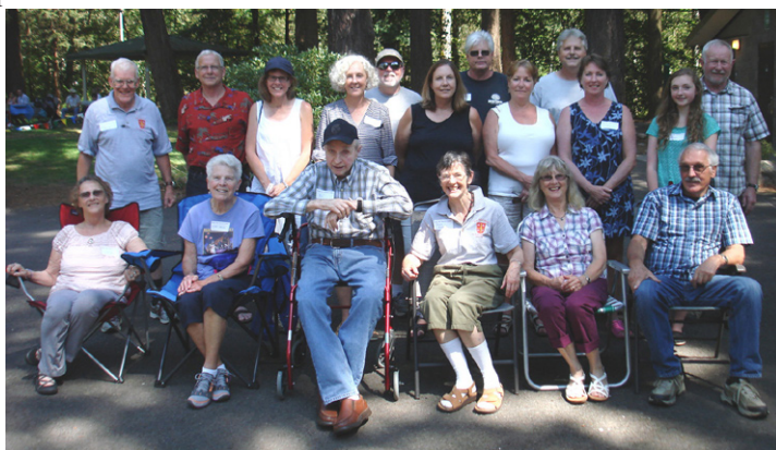
Participants at the 2014 Pacific Northwest Mershon Family Potluck Picnic at Glen Otto Community Park, Troutdale, OR (near Portland).