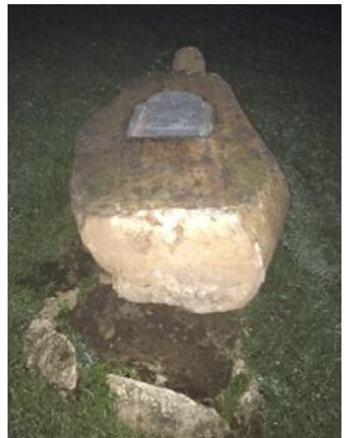
The fallen grave marker boulder. Note the broken grout in the foreground that was around the base of the boulder.