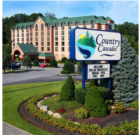
Country Cascades Hotel

Please call 1-800-523-3919 (reservations center), after March 1 st to secure your own individual reservation. Be sure to tell them you are with the MERSHON FAMILY REUNION to get our special group rate. All reservations must be made by April 14 th in order to receive the group rate.