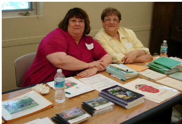
Above Left: Mershon Association Members visiting the Andrew Mershon Tavern.