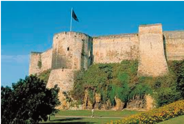
Left: the Chateau de Caen, or castle of Caen.

We traveled from Paris to Caen by train. A grand discovery for us was the Caen Castle, a ten-century-old fortress. Caen is built around the walled "Le Chateau," as it is called in brochures. The castle was built by William the Conqueror in 1060 and is one of the largest medieval fortified enclosures in Europe. Damaged by bombings following the June 6, 1944 D-Day invasion, it has been restored since. It is certainly well worth a visit. Some of our Le Marchand ancestors surely must have walked here.