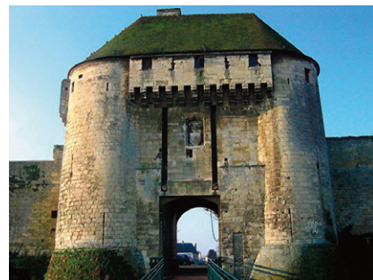
Below: the entrance to the castle.

Note: You can view an 8 minute video of the Chateau de Caen (Caen Castle) at the following online link - https://www.youtube.com/watch?v=GgJfK8H37Ns